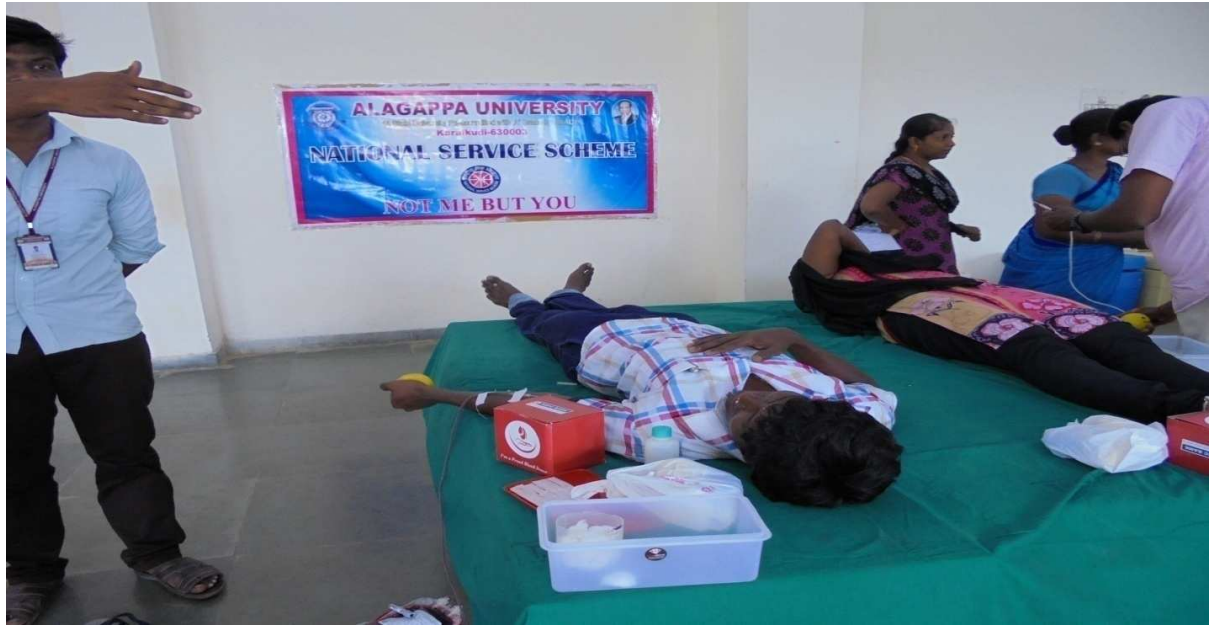
BLOOD DONATION CAMP ON 11.12.2015