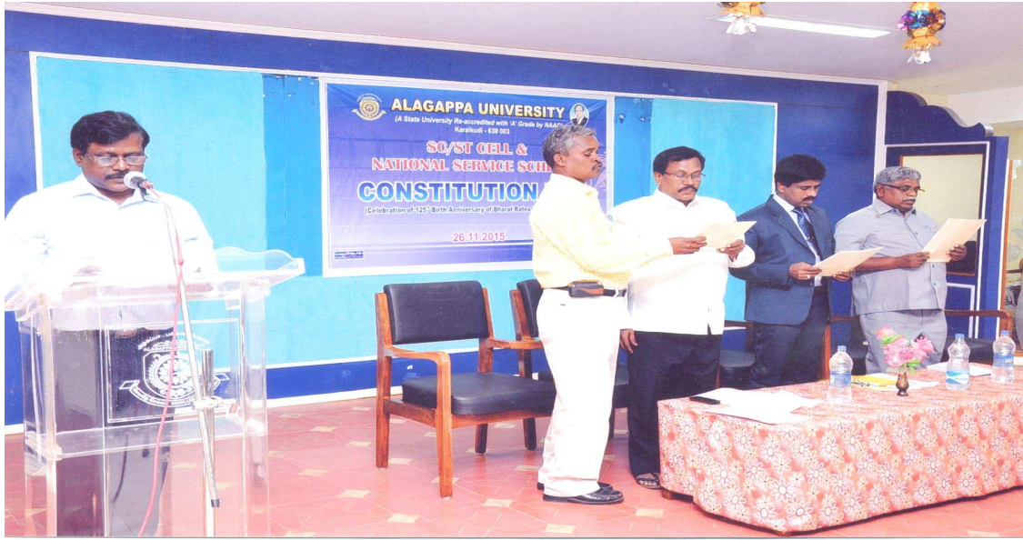
CONSTITUTION DAY ON 26.11.2015