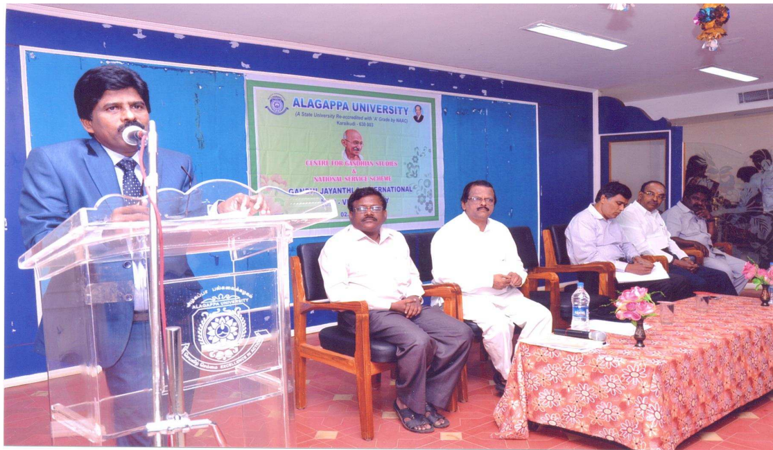
GANDHI JAYANTHI & NON-VIOLENCE DAY ON 02.10.2015