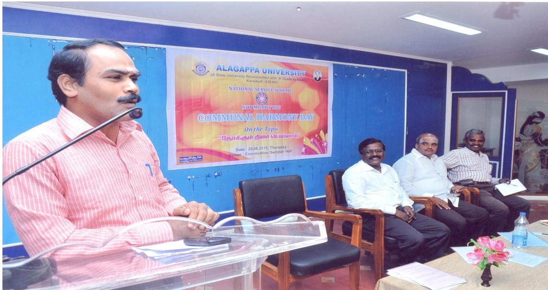
COMMUNAL HARMONY DAY ON 20.08.2015