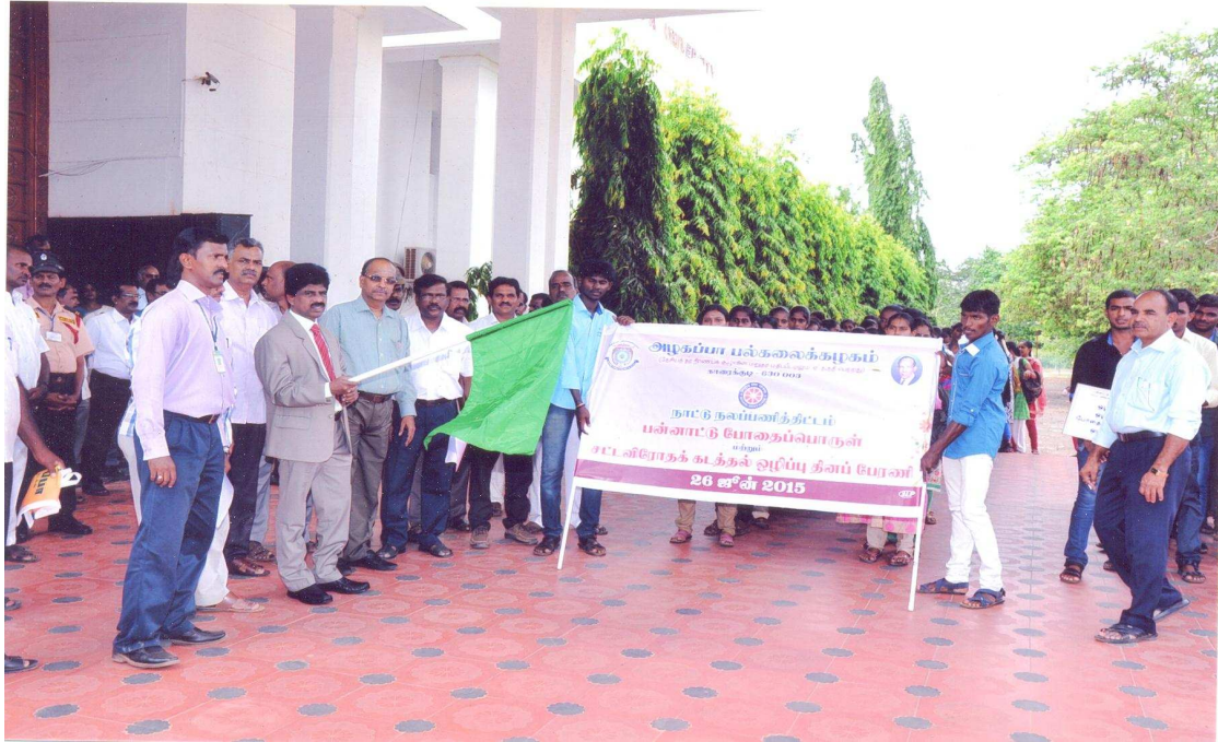
INTERNATIONAL DAY AGAINST DRUG ABUSE AND ILLICIT TRAFFICKING on 26 th JUNE 2015